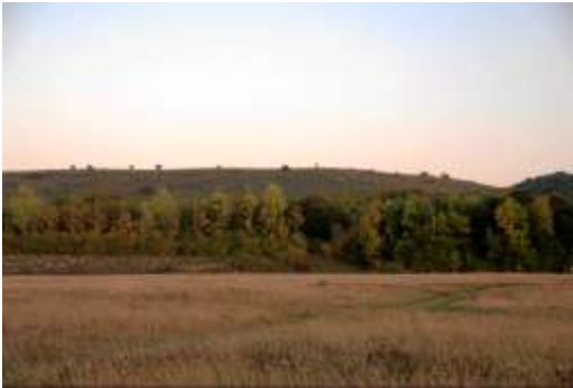
Above: Pitstone Hill from the quarry.