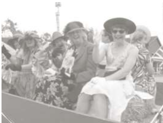
A Royal moment n the float at the Church fete