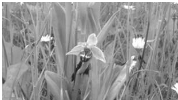
Bee Orchid on Westfield Road

Warwick Road turning to see them. Last winter we counted nearly 300 small plants which we thought were bee orchids over the whole of