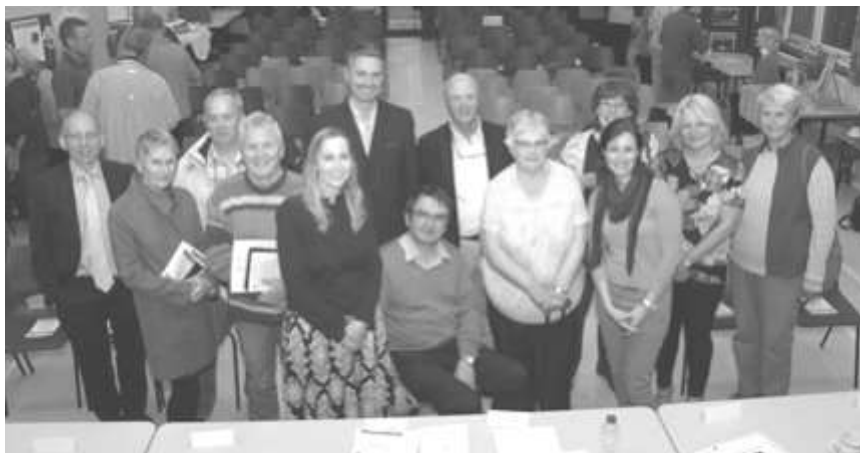
NDP volunteers, who received thank-you cards from PPC

The Parish Council was delighted that a number of the Neighbourhood Plan Steering Group members were able to attend the Pitstone Annual Assembly and receive a small token of thanks from the Council on behalf