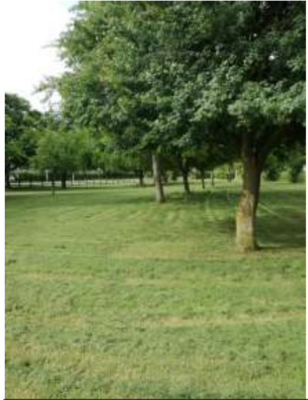
View over the Crescent green space

The triangle of land resides between Marsworth Road and The Crescent and has been utilised as open green space for many years. Due to financial pressures, BCC was exploring the possibility of