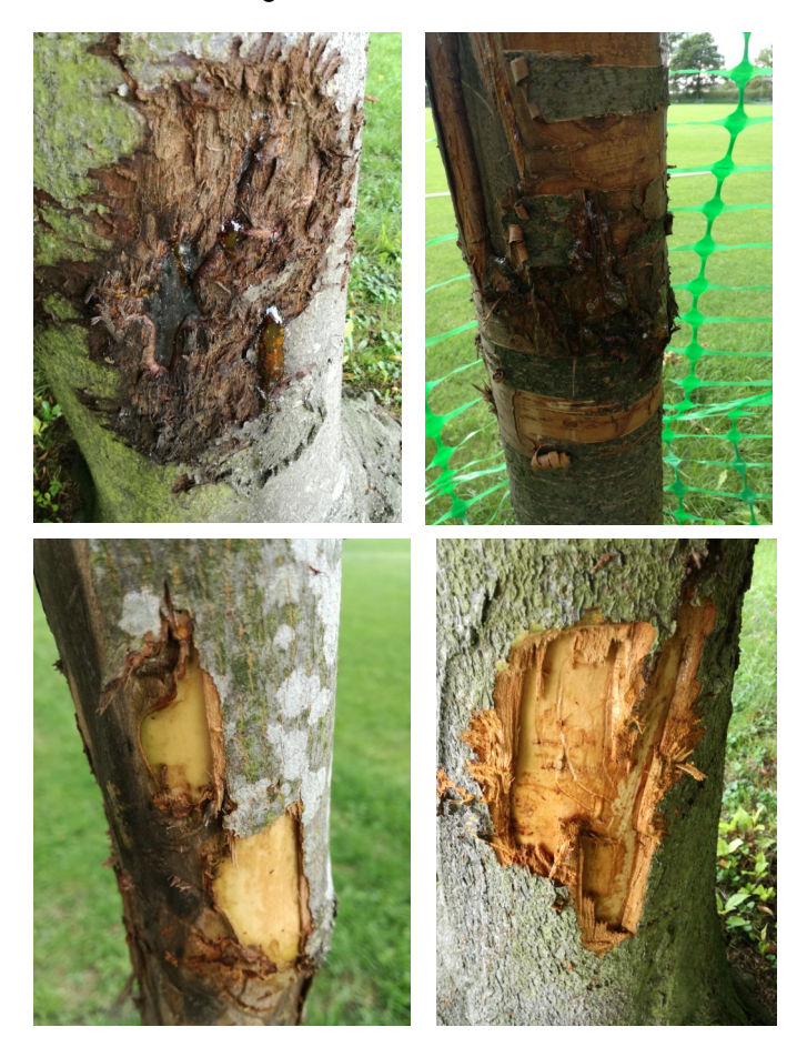
Examples of other trees that have suffered bark damage over the last two weeks:

Please be vigilant if you are on the recreation ground and if you do witness anyone damaging the trees, please report them to Thames Valley Police on Tel: 101. Thank you.