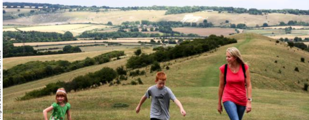
Ivinghoe Beacon