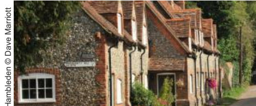
Hambleden