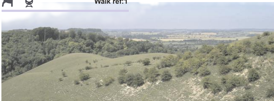
Barton Hills National Nature Reserve

For full details of any of the walks, and to book, go to www.visitchilterns.co.uk/walkingfest