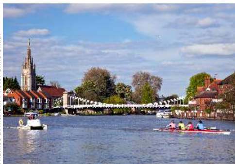
Thames at Marlow.