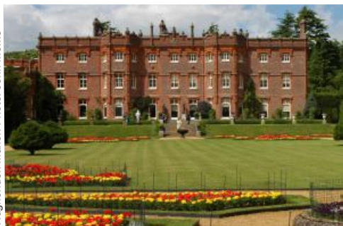
Hughenden Manor.