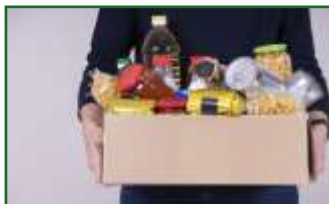
Community Organisation Step-Up Grants