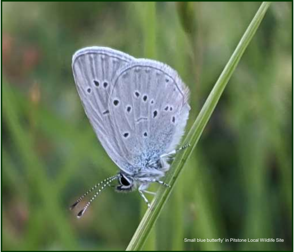
Small blue butterfly' in Pitstone Local Wildlife Site