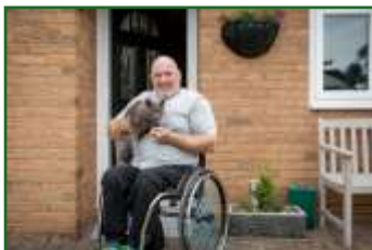
Helping Out Grants