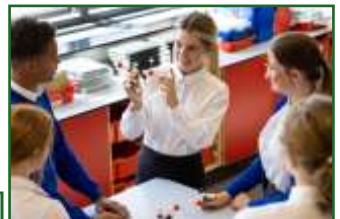
Education Step-Up Grants