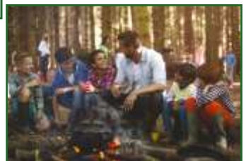
Life Step-Up Grants