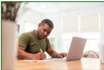
Career Step-Up Grants

* Pitstone Parish Charity, Registration Number: 261752