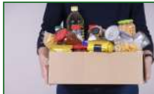
Community Organisation Step-Up Grants