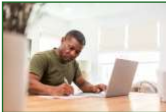
Career Step-Up Grants

otherwise have been unaffordable, or to complete some form of training or upskilling that will demonstrably improve their professional or earning potential, where funding is not available from another source.