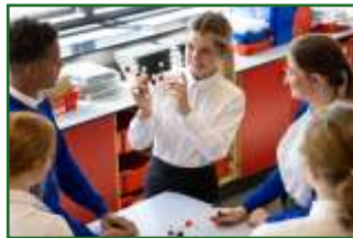
Education Step-Up Grants