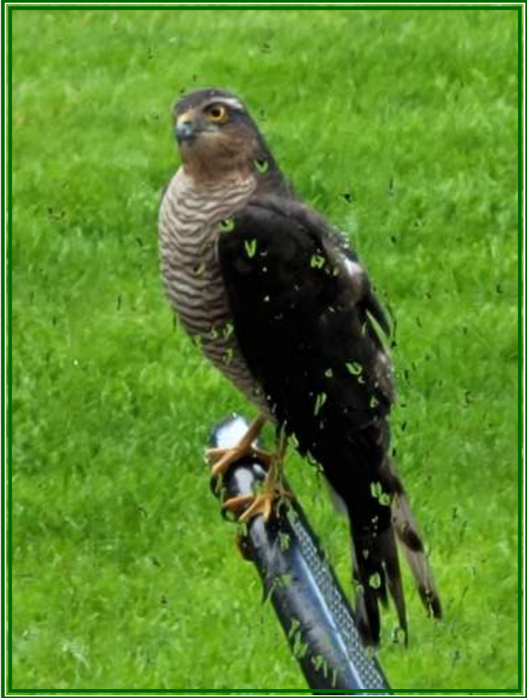
Sparrow Hawk, photographed in Albion Road