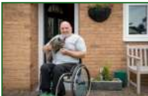
Helping Out Grants