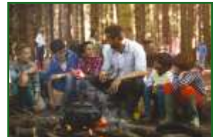
Life Step-Up Grants

• Pitstone Parish Charity, Registration Number: 261752